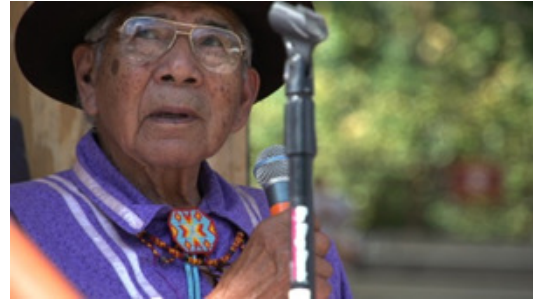
Scenes from the film

“The Eastern Band of Cherokee in the Smoky Mountains of North Carolina now has less than 250 native speakers of Cherokee, with the majority middle-aged and older. The last two generations of Cherokees have been monolingual-English speakers. In an effort to revitalize Cherokee, the tribe has established an immersion school, a language academy, and other programs to enable children to learn Cherokee once again as a native language. The film documents the extraordinary measures being taken to re-establish Cherokee as a native language. This will be the premiere of this documentary, produced by the North Carolina Language and Life Project and the Eastern Band of Cherokee for broadcast on public TV.” (Danica Cullinan and Neal Hutcheson, producers, Walt Wolfram, executive producer.)