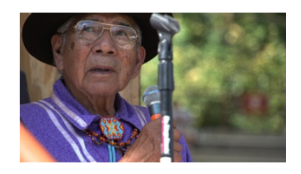
Scenes from the film

"The Eastern Band of Cherokee in the Smoky Mountains of North Carolina now has less than 250 native speakers of Cherokee, with the majority middle-aged and older. The last two generations of Cherokees have been monolingual-English speakers. In an effort to revitalize Cherokee, the tribe has established an immersion school, a language academy, and other programs to enable children to learn Cherokee once again as a native language. The film documents the extraordinary measures being taken to re-establish Cherokee as a native language. This will be the premiere of this documentary, produced by the North Carolina Language and Life Project and the Eastern Band of Cherokee for broadcast on public TV." (Danica Cullinan and Neal Hutcheson, producers, Walt Wolfram, executive producer.)